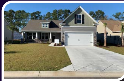
212 Sage Cir. Little River, SC Diamond Floor Plan 4 BDR 3 BA $403,900