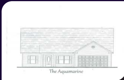
208 Sage Cir. Little River, SC Aquamarine Floor Plan 4 BDR 3 BA $507,500

ALL HOUSES INCLUDE STONE FRONT, RING DOOR BELL GRANITE COUNTERTOPS, 30" BIRCH CABINETY WITH CROWN MOLDING, CERAMIC FLOOR IN KITCHEN, LAUNDRY, ALL BATHS, WATERPROOF LAMINATE IN FAMILY/ FOYER.