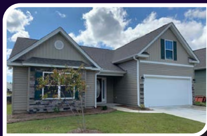
224 Sage Cir. Little River, SC Princess Floor Plan 4 BDR 3 BA $370,900