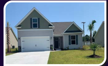
216 Sage Cir. Little River, SC Emerald Floor plan 4 BDR 3 BA $368,000