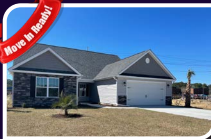
220 Sage Cir. Little River, SC Tanzanite Floor Plan 4 BDR 3,5 BA $444,500