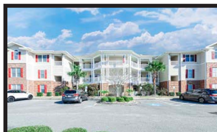
3 BR, 2 BA home w/2-car Gar in Indigo Creek. Tiled foyer, Formal dining rm, large Kitchen w/breakfast bar & nook, Carolina rm, Oversized patio. MLS #2203260 $335,000 3 BR, 2.5 BA top floor condo in The Fairways @ International Club. Elegant foyer, greatrm w/fp, dining area, Kitchen w/Corian counter tops, pantry & breakfast bar. Oversized screened-in porch. MLS # 2202846 $265,000