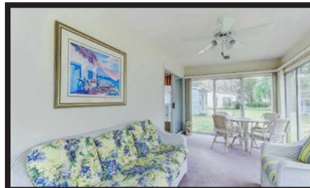
Located in popular 55+ community of Woodlake Village, this 3BR 2BA home offers an open floor plan with Living room, spacious eat-in kitchen, breakfast nook, formal dining room, spacious Carolina Room (Carolina Room furniture conveys). Oversized patio. 2 car garage w/utility sink. MLS# 2205982 $289,000