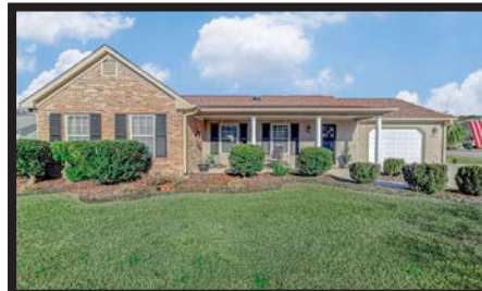
3 BR, 2.5 Ba smart home in Oak Arbor. Family rm, dining area, kitchen w/ granite, flex rm, loft area. Patio, large fenced-in wooded backyard, 2-car garage. Natural gas. MLS #2202759 $388,000 3 BR, 2 BA condo in popular Stonegate at Prince Creek. Premier lot w/ pond views. Living rm w/gas fp, dining rm, kitchen w/ Corian counters. Carolina rm, 2-car gar. MLS # 2203016 $375,000 2 BR, 2 BA home in popular 55+ community of Woodlake Village. Living rm, Dining Rm area, remodeled gourmet Kitchen w/granite, breakfast bar. Carolina rm. Garage extended or golf cart storage. MLS # 2202982 $299,000